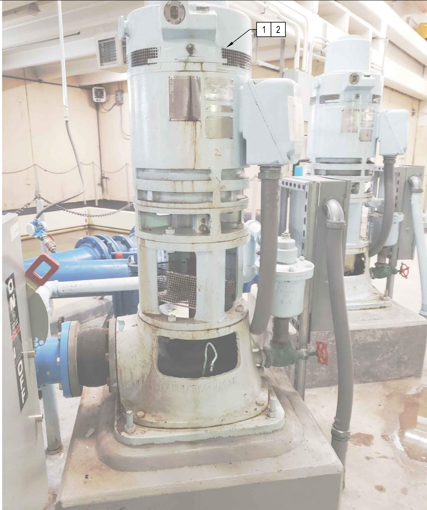
3 PHOTO 3: PUMP 2 SCALE: NOT TO SCALE