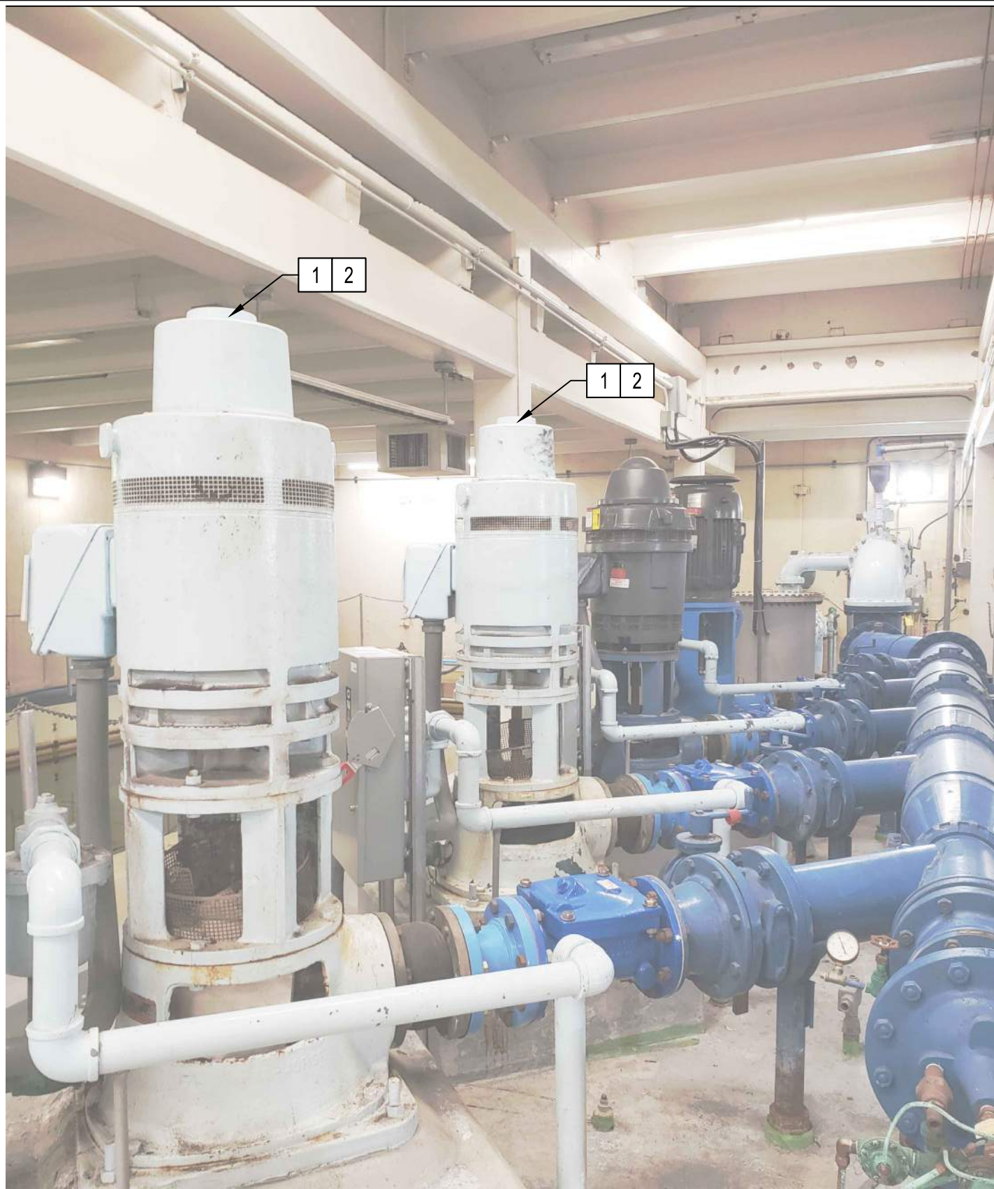
1 PUMP 1: PUMP GALLERY SCALE: NOT TO SCALE