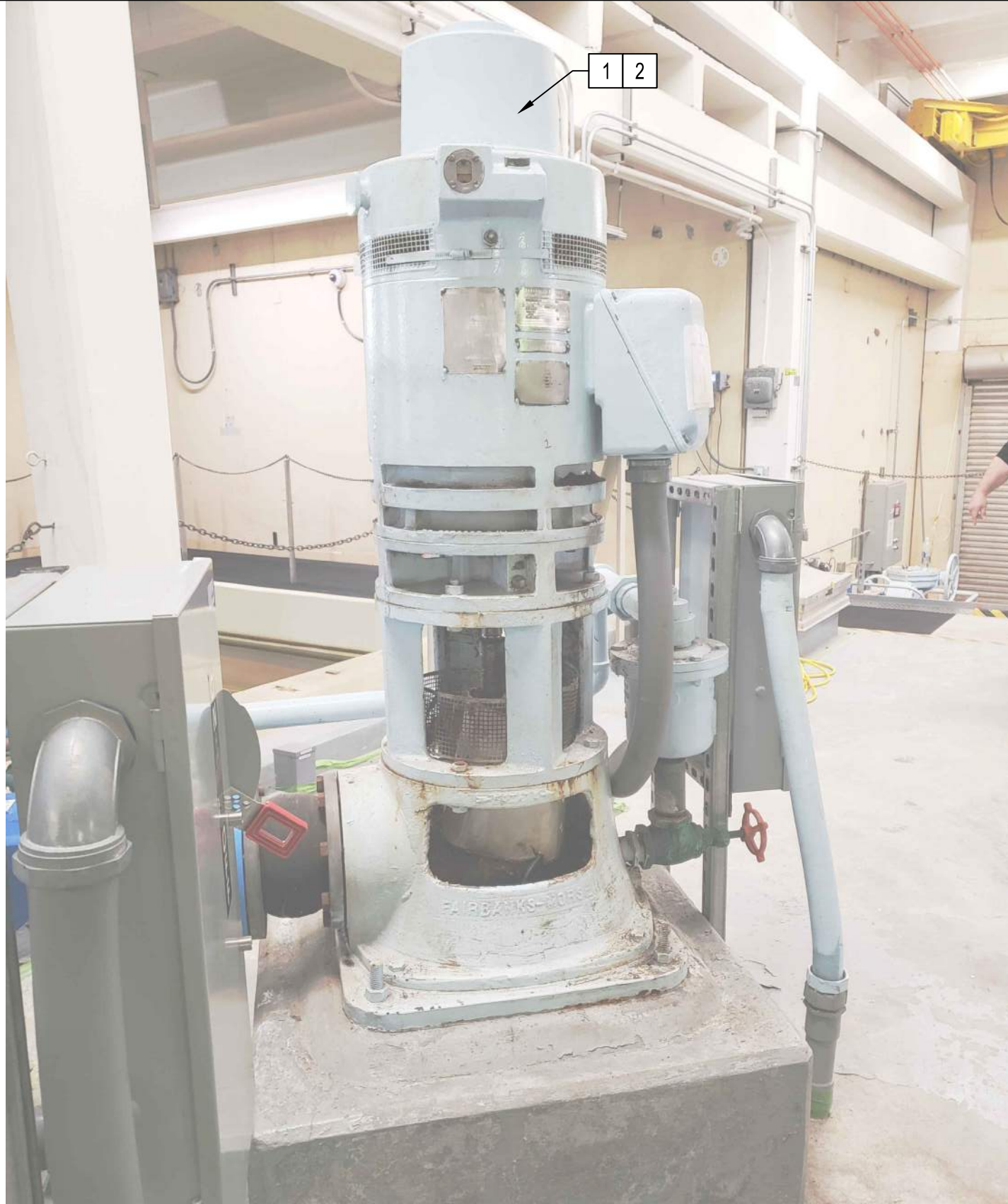
2 PHOTO 2: PUMP 1 SCALE: NOT TO SCALE